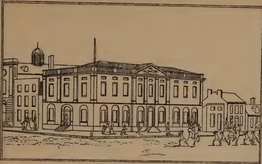
CITY ASSEMBLY ROOM AND LIBRARY.